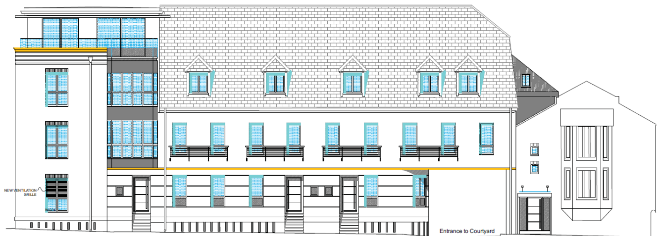
Brocas Street Elevation