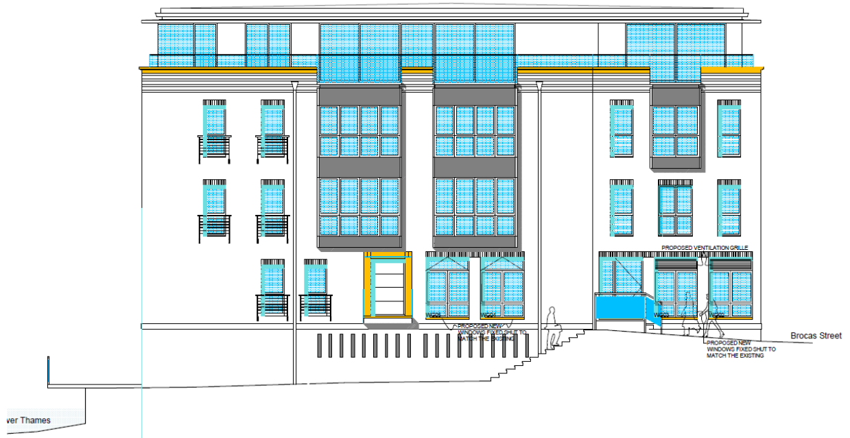
High Street Elevation